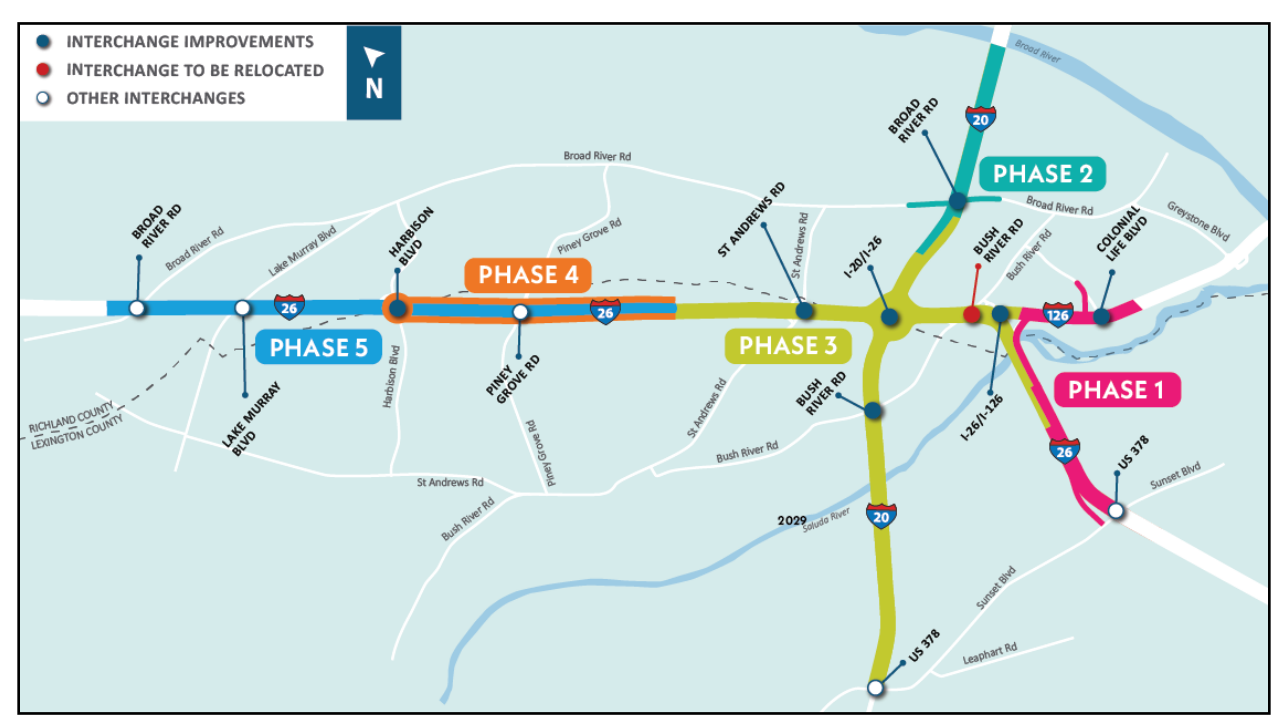
Figure 100-1: Carolina Crossroads Program Phasing Map